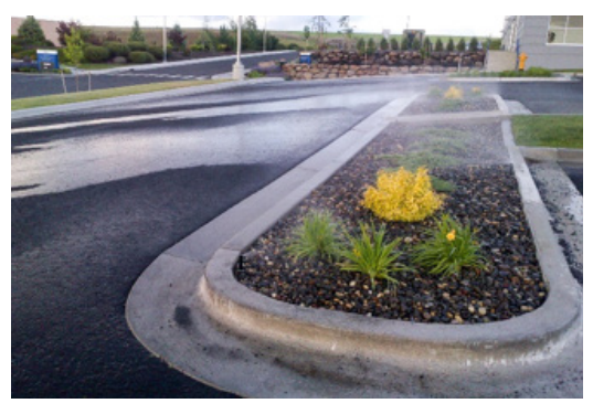
Figure 2—Water Runoff on SEL Zocholl Parking Lot

Using the water consumption data available from the SEL meters (shown in Figure 3), Dennis quickly realized that an irrigation program was running twice per night instead of once. After making a system correction, he was able to reduce the daily water consumption by 32 percent, or 4,000 gallons per day. He was also able to verify that the system was not running on rainy days.