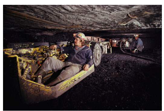
Figure 1—With the high cost of gas and oil fueling the demand for coal, some coal mining operations are straining to achieve higher production capacities while remaining vigilant about safety. This underscores the importance of supplying and distributing reliable electric power to operate mining equipment and support the needs of personnel above and below ground.

"Event reports can instantly provide a snapshot of power system conditions when a fault occurred," Goble continues, "which can be a crucial aid in post-fault analysis and help determine quickly what should be done about it." Additionally, event reports can improve an engineer's understanding of both simple and complex protective scheme operations and also aid in testing and troubleshooting relay settings and protection schemes.